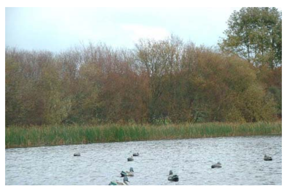
Figure 4: View of grey willow carr with Eleocharis sphacelata in foreground, typical of transect two.

Salix cinerea dominated the canopy of transect two with no L.scoparium present. No sub canopy species were encountered and the ground cover consisted of rank pasture grasses as found at transect two, Lycopus europeaus , Phormium tenax , Dacrycarpus dacrydioides (saplings), Carex virgata , and individual Carex maorica . Marginal species found in transects one and two were absent in transect two where S.cinerea grew out over open water (Figure 4).