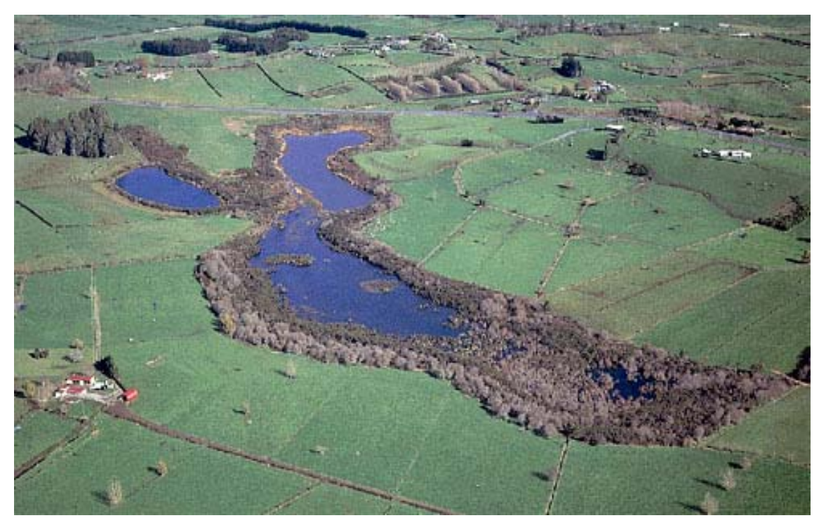
Figure 1: Aerial view of the Lake Serpentine complex looking south west towards State Highway 3. Lake Serpentine North is obscured to the right.

The Lake Serpentine North catchment is completely pastoral, surrounded on all sides by intensive dairy farming (Figure 1). The conversion of peatland to agricultural land with drainage and the use of fertilisers have resulted in the characteristics of Lake Serpentine North's water chemistry changing from highly dystrophic to mildly eutrophic.