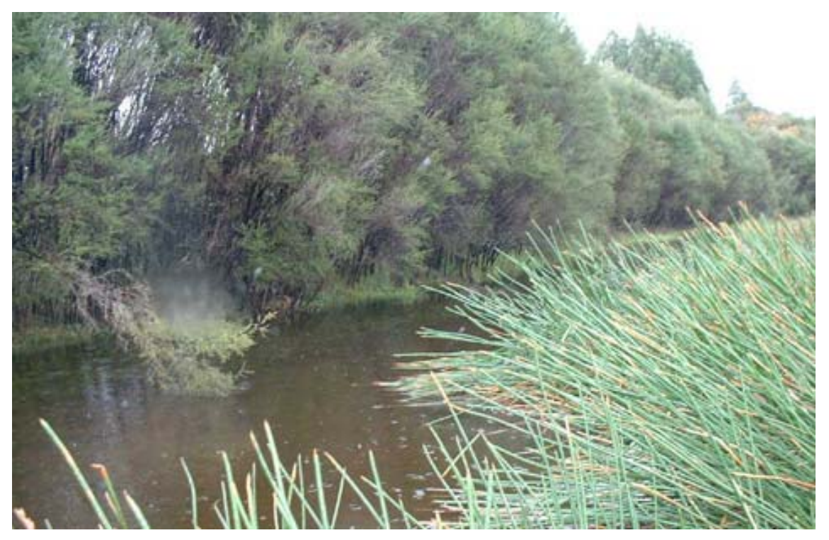
Figure 3: View of boundary between land and aquatic ecotone at Transect three. Photograph taken during winter when the level was elevated and the marginal turf community submerged.

The marginal community was consistently uniform in composition across transects one and three, with Eleocharis acuta , Glossostigma elatinoides , Myriophyllum propinquum , Juncus bulbosus , Isolepis prolifer , I.reticularis , Myosotis Iaxa , Nertera scapanioides , Potamogeton cheesemanii and Schoenus maschalinus present (Figure 3). Eleocharis acuta , J.bulbosus , G.elatinoides and Callitriche stagnalis were common while occasional occurrences of the other turf species were observed. Clumps of Baumea huttonii and B.articulata occurred infrequently. The marginal community at Transect two was depauparate with isolated pockets of Eleocharis acuta , Glossostigma elatinoides and Myriophyllum propinquum growing under a Salix cinerea canopy.