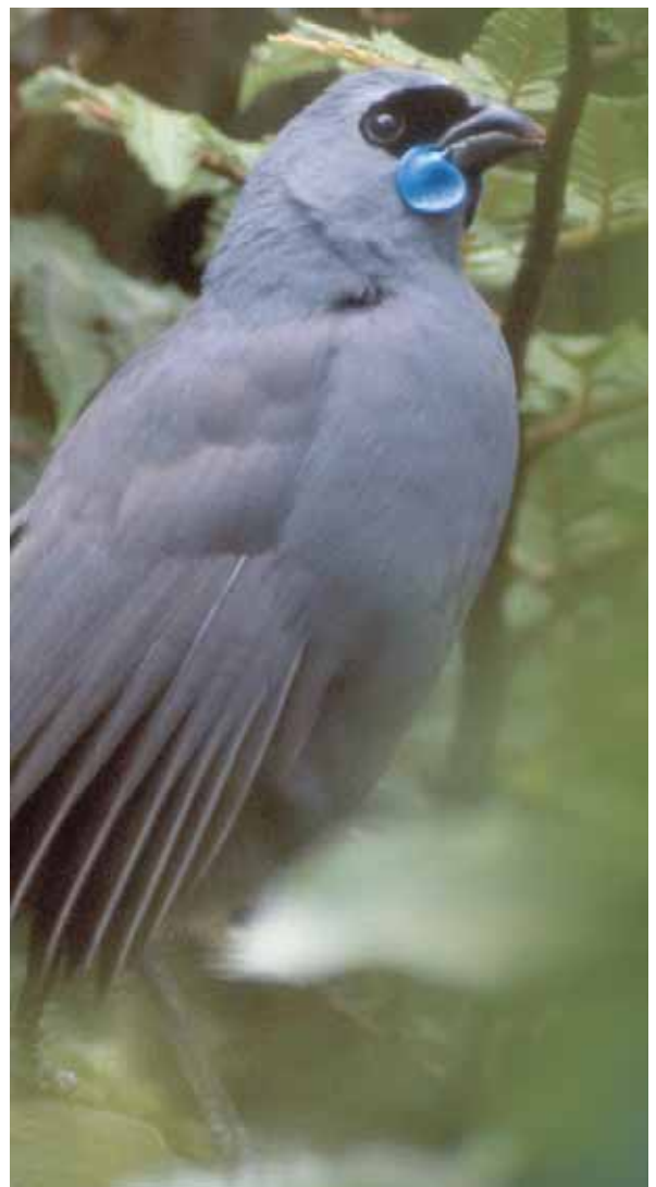
North Island Kokako.

There are a number of rules in the Regional Plan and Regional Coastal Plan which have conditions or standards which may help to avoid, remedy or mitigate adverse effects on indigenous biodiversity. This is particularly so for rules related to wetland drainage, vegetation clearance, works in the Coastal Marine Area and takes, discharges or works in water bodies. Environment Waikato staff undertake a range of regulatory responses where such rules are not complied with. Table 1 shows the number of enforcement activities which were undertaken from March 2005 to March 2006.