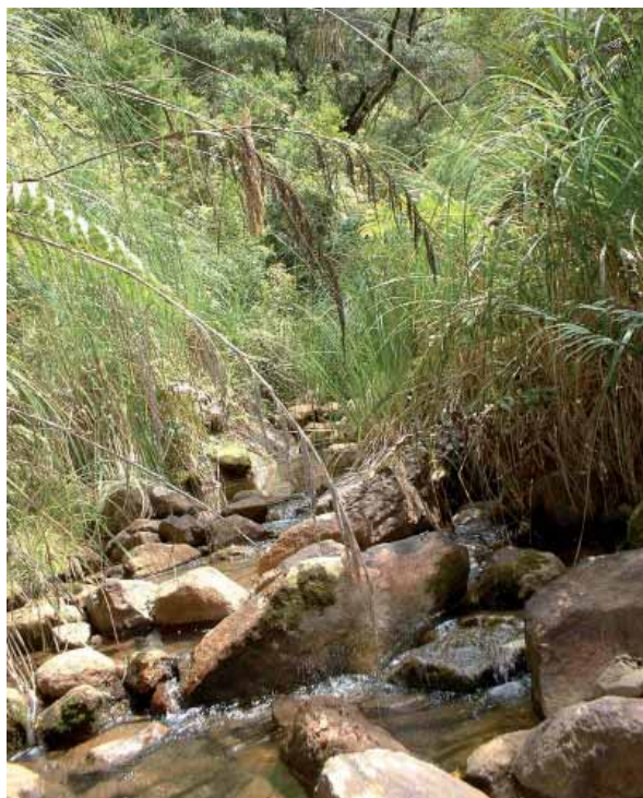
Kirikiri Stream, Coromandel.

There should be consideration of stronger protections in the Regional Policy Statement and regional plans for indigenous terrestrial biodiversity.