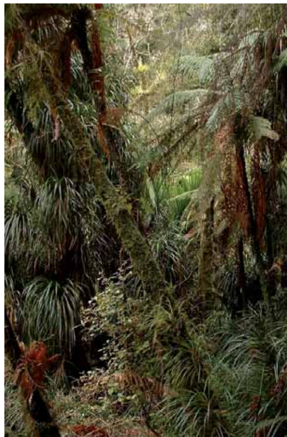
Native Bush, Te Kauri.

Section 3.15 of the RPS describes issues, objectives, policies and implementation methods for heritage. Natural heritage is dealt with in this report, while cultural heritage matters will be the subject of a future report.