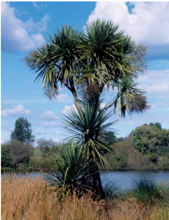
Native cabbage tree.