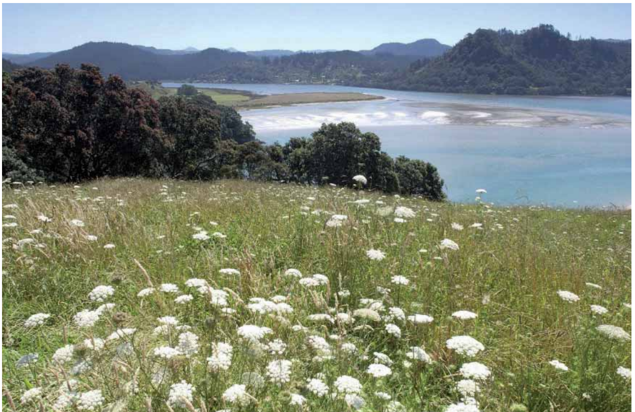
Opoutere Harbour, Coromandel.

It should be noted that the policies and methods for the objective do not envisage regionally significant heritage resources being inventoried. Instead, the significance of particular heritage resources is to be assessed on a case by case basis through district plan development processes and through resource consent processes. The objective is to be achieved by providing adequate protections to heritage resources through these processes, as well as through education and general advocacy.