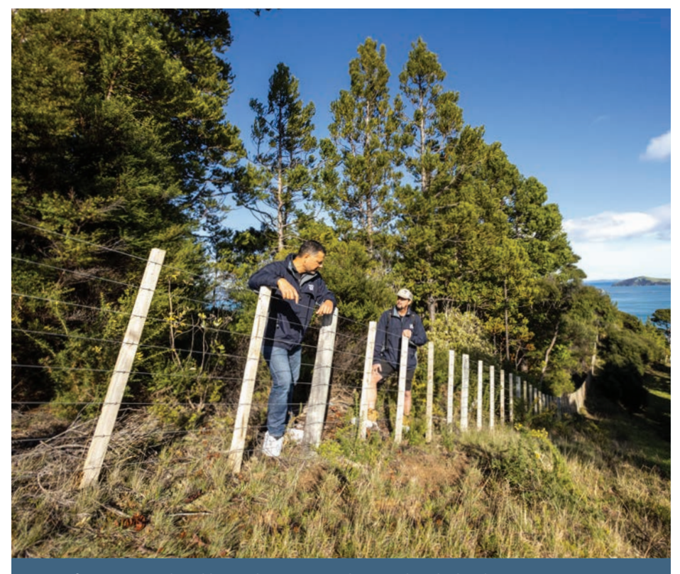
New fencing completed by Waikato Regional Council and a landowner in Long Bay to protect kauri from stock.

If you are worried about the health of kauri trees or would like to discuss how best to protect kauri on your property, contact the council.