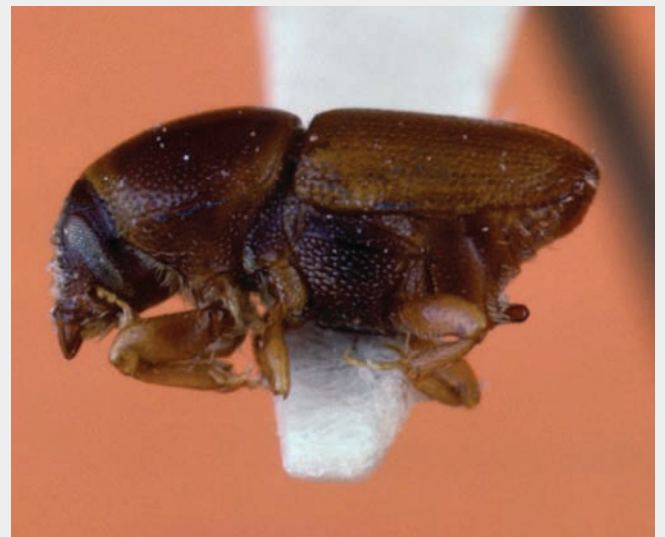
The European elm bark beetle ( Scolytus multistriatus ).