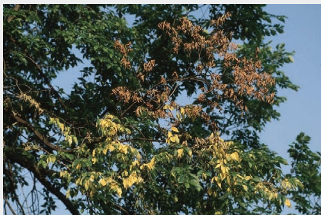
Flagging on an elm tree.