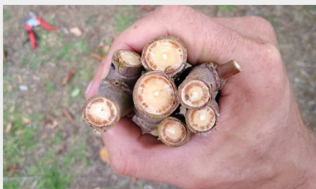
Characteristic staining on a cross section of elm branches.