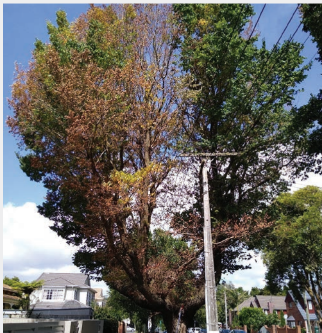
A dying elm infected with DED.

Symptoms develop quickly within a four-to-five week period. Early symptoms include wilting and/or yellowing leaves on the tip of a branch and then turning brown and curling up. The leaves are usually retained on the branch for some time. These symptomatic branches are called flags, and their appearance in an otherwise healthy crown is called flagging. As the disease progresses, more flags will appear until the whole crown becomes symptomatic. Other, more diagnostic symptoms of DED include a brown to black streaking or discoloration under the outer bark of infected branches. However, only a trained diagnostician can confirm the presence of DED by conducting specific laboratory tests.