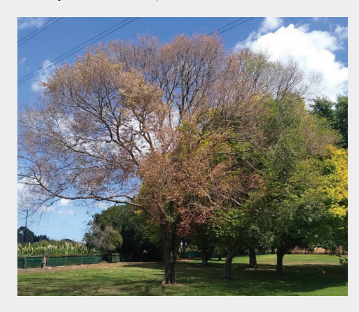
If you see a dying elm, please report it to MPI.