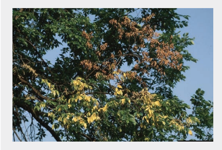
Flagging on an elm tree.