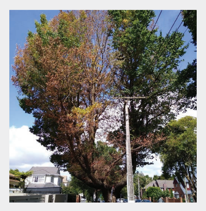
A dying elm infected with DED.

Symptoms develop quickly within a four-to-five week period. Early symptoms include wilting and/or yellowing leaves on the tip of a branch and then turning brown and curling up. The leaves are usually retained on the branch for some time. These symptomatic branches are called flags, and their appearance in an otherwise healthy crown is called flagging. As the disease progresses, more flags will appear until the whole crown becomes symptomatic. Other, more diagnostic symptoms of DED include a brown to black streaking or discoloration under the outer bark of infected branches. However, only a trained diagnostician can confirm the presence of DED by conducting specific laboratory tests.