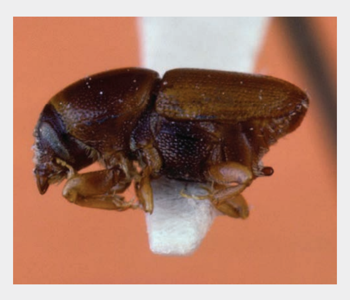
The European elm bark beetle ( Scolytus multistriatus ).