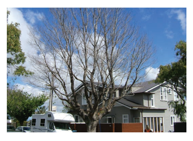
An infected elm tree can die in as little as three weeks.

Dutch elm disease (DED) is caused by two species of fungus (Ophiostoma ulmi and O. novo-ulmi) and is considered one of the most devastating tree diseases in the world. It can be spread by tiny elm bark beetles from elm to elm, via the trees' root systems, movement of firewood or by contaminated pruning tools. The fungus blocks the elm's water and nutrient conducting system. An infected elm tree can die in as little as three weeks or over a period of two to three years.