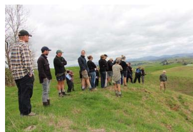
Checking out the view over Piopio.