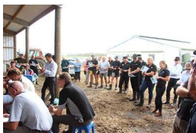
Many enjoying the discussions at Aka Aka.

More than 50 attendees turned out over two days for an effluent field day in Aka Aka and a stock wintering and soil health field day in Piopio.