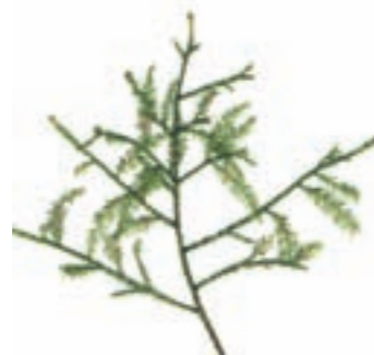
Kahikatea: bark, left and foliage, above.