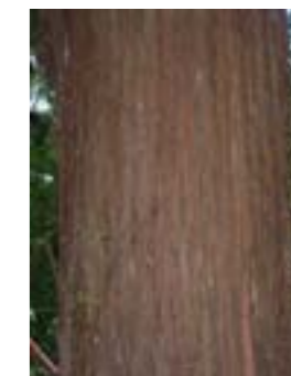
Totara: foliage, top, and bark, below.

Matai and totara are called softwoods because of their ease of working while the third tree here is tawa ( Beilschmiedia tawa ), a hardwood.