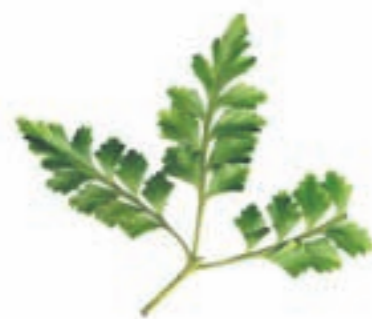
Tanekaha: foliage, above, and bark, left

This ridge once had a number of native hard beech trees, but they have all succumbed to what was probably a root disease. Since 2005 all but one of the large beech trees have died.