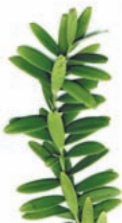
Kauri: Bark, left, and foliage, above.

Now walk up to the track junction and turn right to the kauri grove.