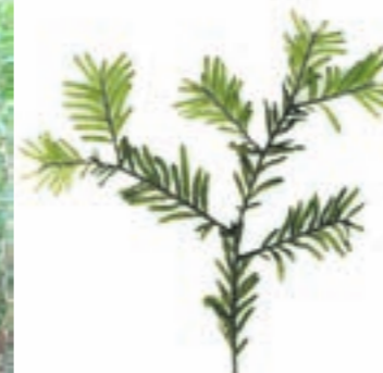
Matai bark, left, and foliage, above.

Totara ( Podocarpus totara ) has a trunk with a most distinctive appearance, best described as stringy, with long strands of grey, furrowed bark. The leaves are 1-2 cm long and quite sharp. Totara wood was highly prized for posts and house piles because it resists decay in the soil for 50 or more years. It is even more highly sought after now for carving and was the most predominant timber for the construction of waka (canoes).