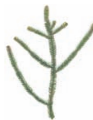
Rimu: bark, left, and foliage, above.

The foliage consists of tiny leaves on drooping branchlets giving the tree its distinctive soft, dark-green appearance. Rimu is New Zealand's perfect furniture soft wood timber being easily worked, strong, durable and with a complex and lustrous deep-red grain.