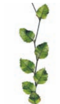
Beech: bark, left and foliage, above.

Kauri ( Agathus australis ), New Zealand's largest tree, is close to its natural southern limit here at Pukemokemoke. The bark of kauri is smooth with only a few grey lichens, and flakes off in saucer to dinner plate sized flakes leaving an interesting mosaic of brown and red plaques. Long drip lines of kauri gum can often be seen dribbling from the trunk. Kauri has produced enormous amounts of superior timber, perfect for boat building, furniture and finishing work.