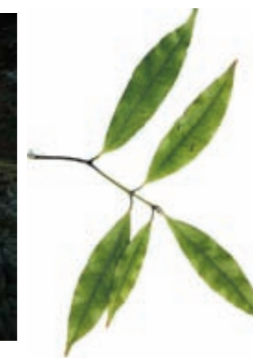
Tawa: Bark, above and foliage, right.

Note the number of tawa seedlings on this part of the track. Tawa produces a hard, light-coloured, strong wood, used for flooring, also for dowels and handles.